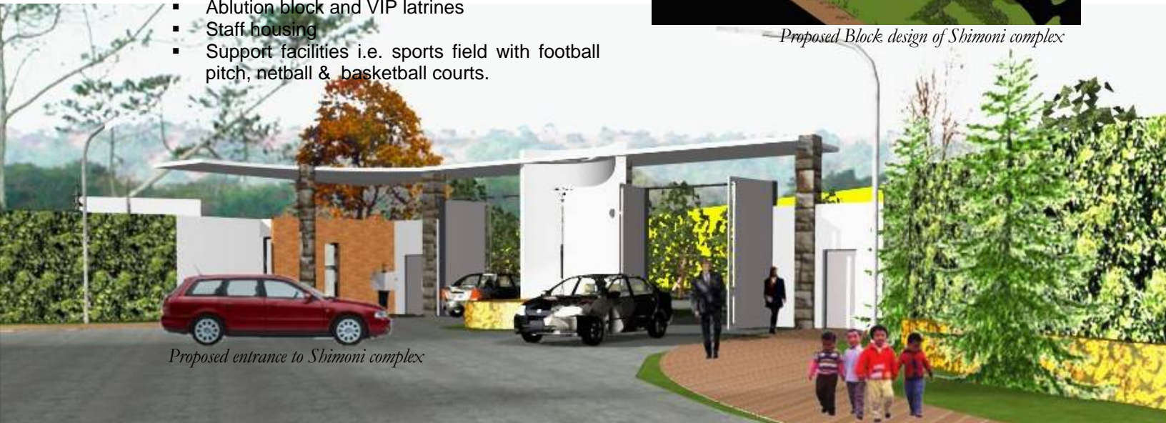
Proposed entrance to Shimoni complex