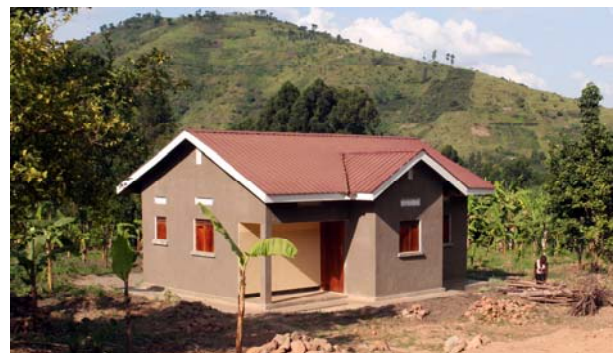
Affordable housing unit constructed for the RAP in Kasese, Bugoye HPP

NEWPLAN was contracted by Tronder Power Limited to create and implement a resettlement action plan for the population in Kasese district affected by the establishment of the hydro plant in the area. This involved the design and construction supervision of housing in resettlement areas.