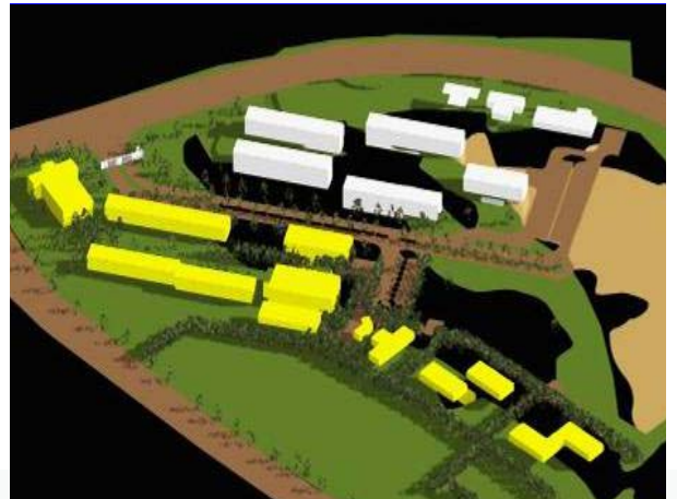
Proposed Block design of Shimoni complex