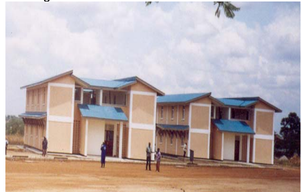
Arapai College; Student Dormitory blocks

The college has up to 300 students and over 60 buildings.