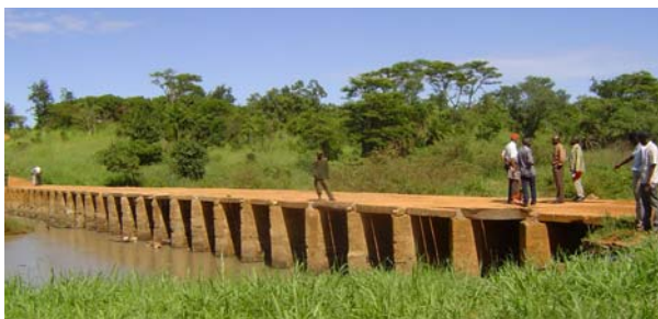
Assessment of Aswa Bridge in Gulu

The services provided included preparation of Wrap-Up Report, Proceedings Report, Action Matrix and Aide Memoire.