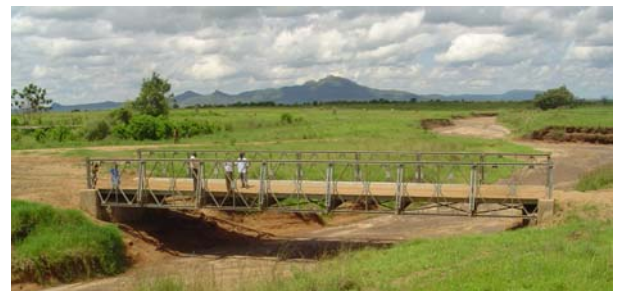
Assessment of Nalakas Bailey Bridge, Kotido